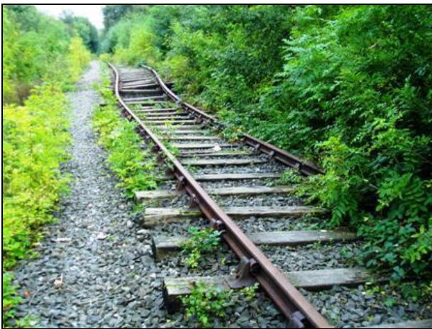
Broken Banks – the scene before clearance by the Sunday Gang and follow up work by the Project Connect team.