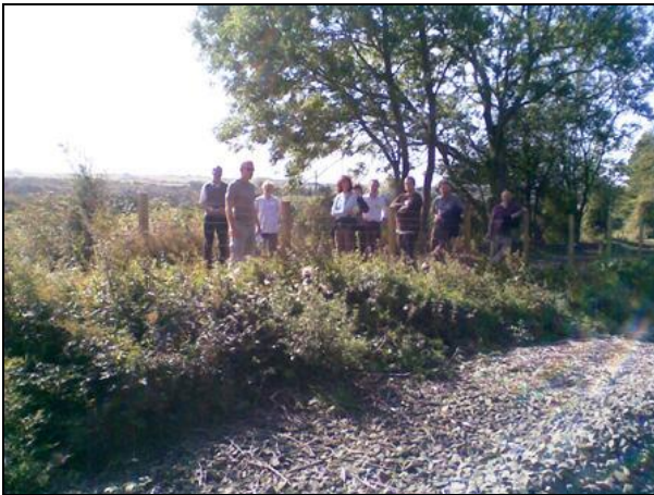
National Rights of Way Officers Conference delegates with DCC representatives examining the newly constructed lineside Footpath at Witton le Wear.