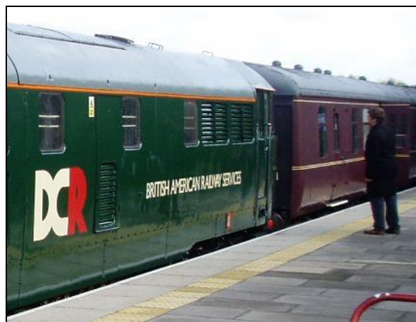
Left : 31452 in its new livery in Ruddington station, near Loughborough on the Great Central Railway – and on the Right an enlargement of the new logo and the British American Rail Services identification