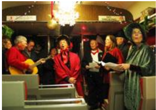
Pictures from the Rio Grande Scenic Railway publicity on their website