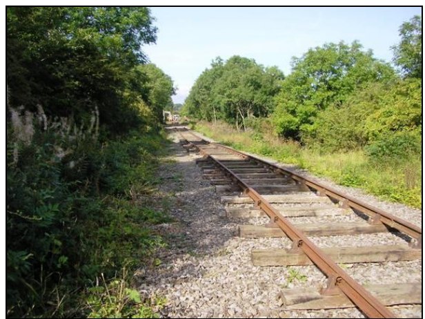
Broken Banks – after the first phase of the remedial work. Top profiling and re-ballasting still to complete, in next few Days.