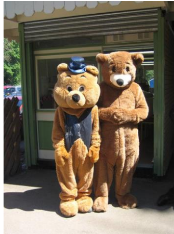
Two bears spotted at Wolsingham answering to the names of Mike and Jordan.