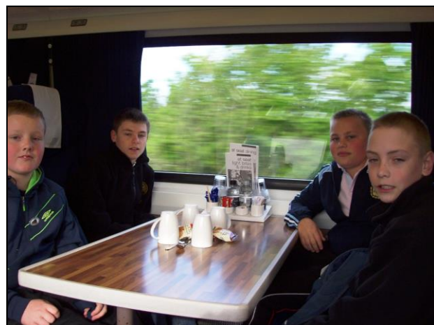
On the train – First Class – en route to London