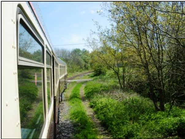
The 141 passing Enginemans Terrace Crossing on May 13 visit of the Railway Inspector