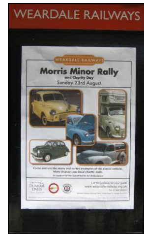
Poster for Morris Minor Rally ( 23 August)