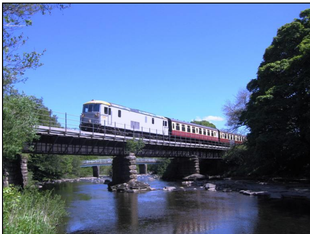
73139 hauling the coaching stock across Broadwood bridge on May 24 th .