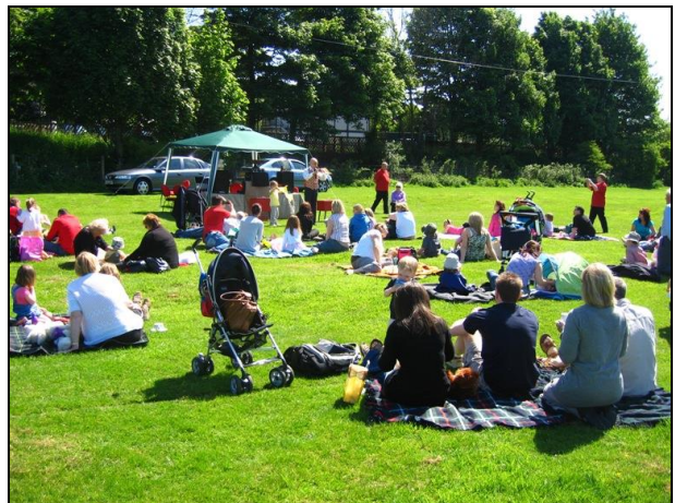
The picnic field at Bondisle, Stanhope on May 24 th, the day the Teddy Bears had their picnic.