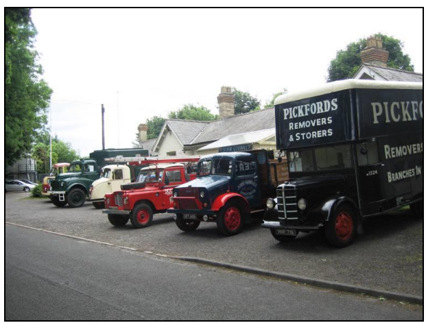
Vehicle parking at Stanhope Station on Fathers Day