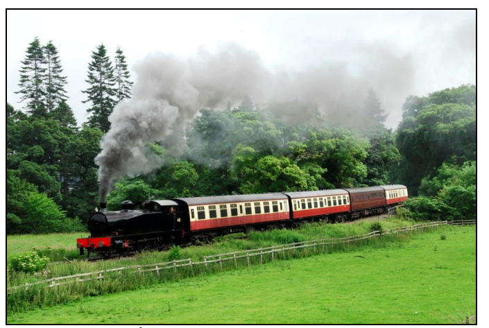
No 40 again on 29<sup>th</sup> June just after crossing Keilder Bridge (J Lewins)