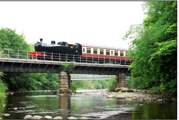
Two more photos of No 40 on June 29<sup>th</sup> On the left standing at Frosterley. You can see the lining out on the cabside, Since then the WR crest has been added On the right the classic Broadwood Bridge viewpoint.