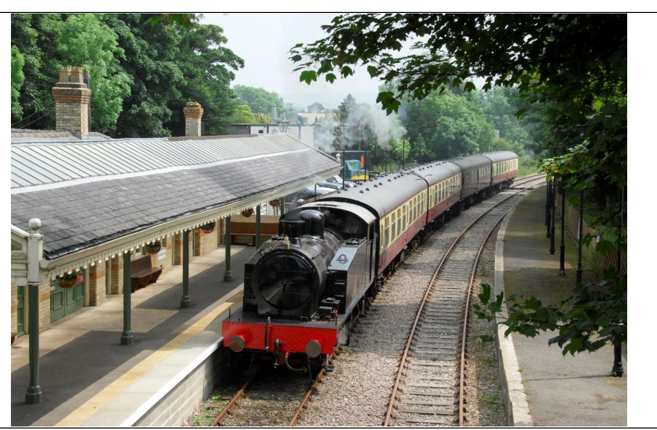
No 40 with coaching stock in Stanhope Station on Monday 29 June 2009