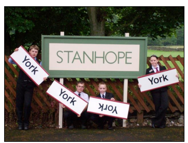
The former GNER station signs from York Station – now available for auction

• STANHOPE STATION: JULY 5<sup>th</sup> SALE: On this day the Junior Club will again be running a fund raising stand offering ex GNER branded crockery and glassware which were donated to the Junior Club by National Express East Coast, also available are a number of redundant station name signs from York station which NXEC have donated for auction. The York station signs will be available via auction bids either on the day or via email <a href="mailto:admin@wrjc.org.uk">admin@wrjc.org.uk</a>, the highest bidders by the end of the event will get the opportunity to purchase a sign, approx 13 signs will be available.