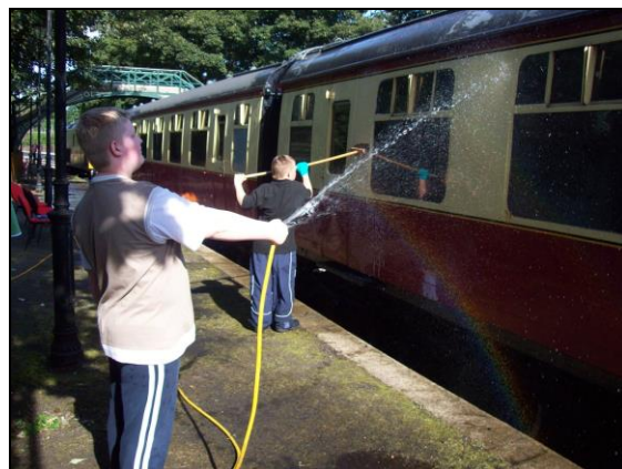
Volunteers and WRJC members cleaning the coaching Stock prior to the War on the Line event