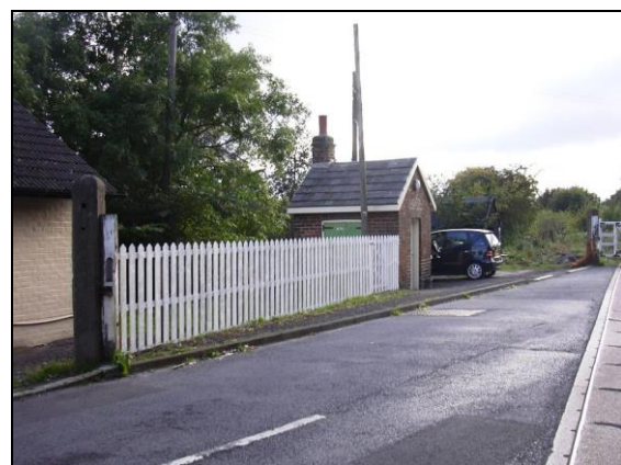
Witton le Wear Crossing Keepers cabin, externally complete and with fencing reinstated ( T Hewitt)