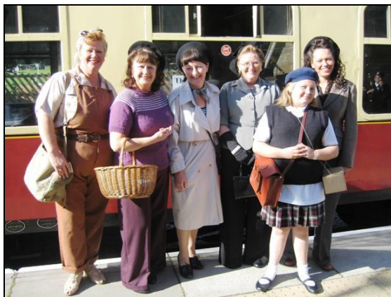
Some of the re-enactors on the platform at Stanhope