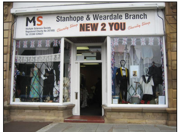
Shops in the Rown also participated by arranging special displays ( J Askwith)