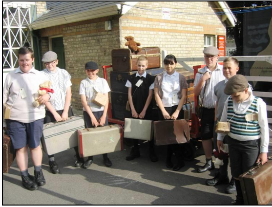
'Evacuees' aka the WRJC complete with suitcases and gasmasks at a wartime Stanhope station