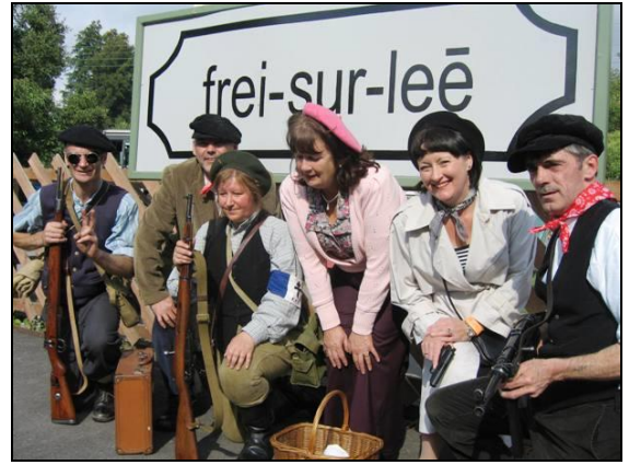
The French Resistance assemble at a renamed station and await the arrival of the German Army ( J Askwith)