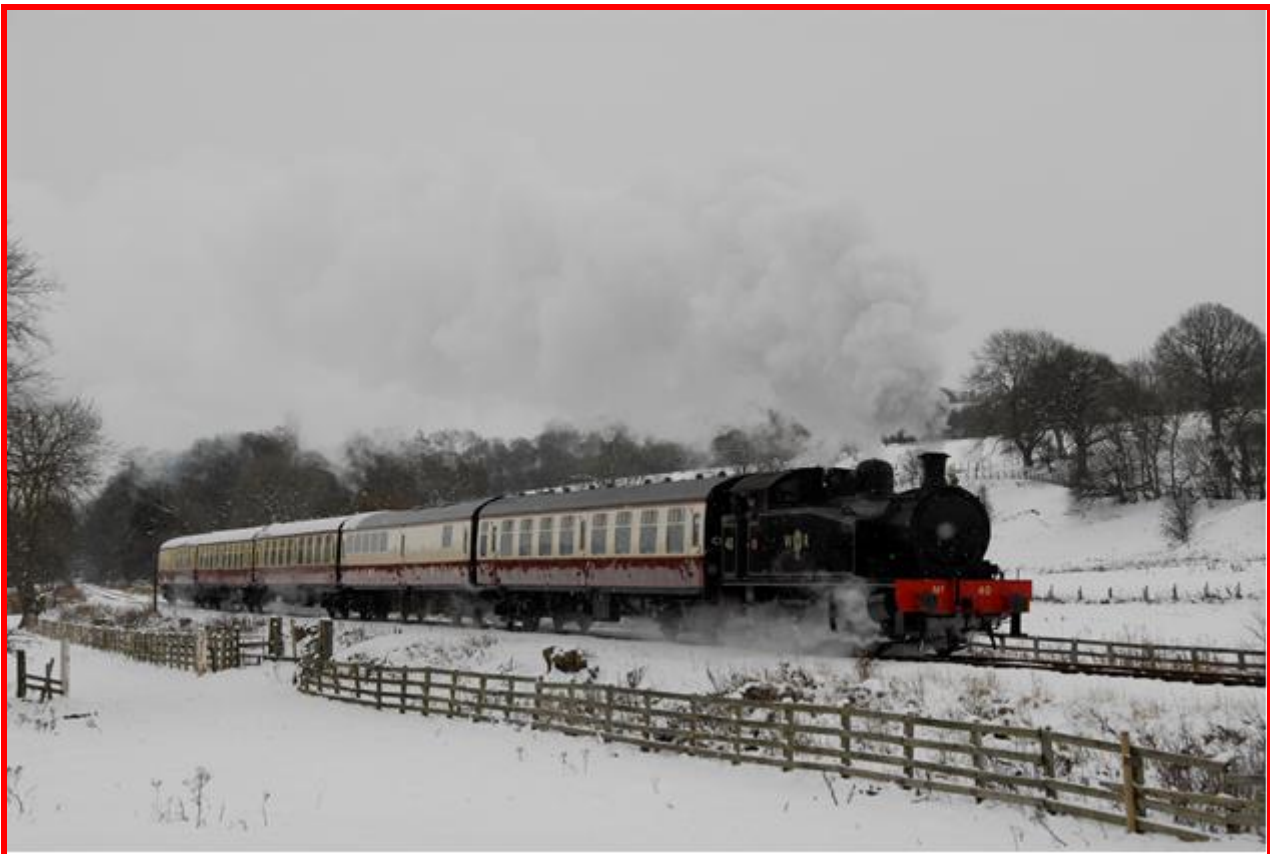
STEAMING THROUGH THE SNOW : No 40 with the full rake of coaches passing Holebeck 1 on the afternoon run to Stanhope on November 28 .