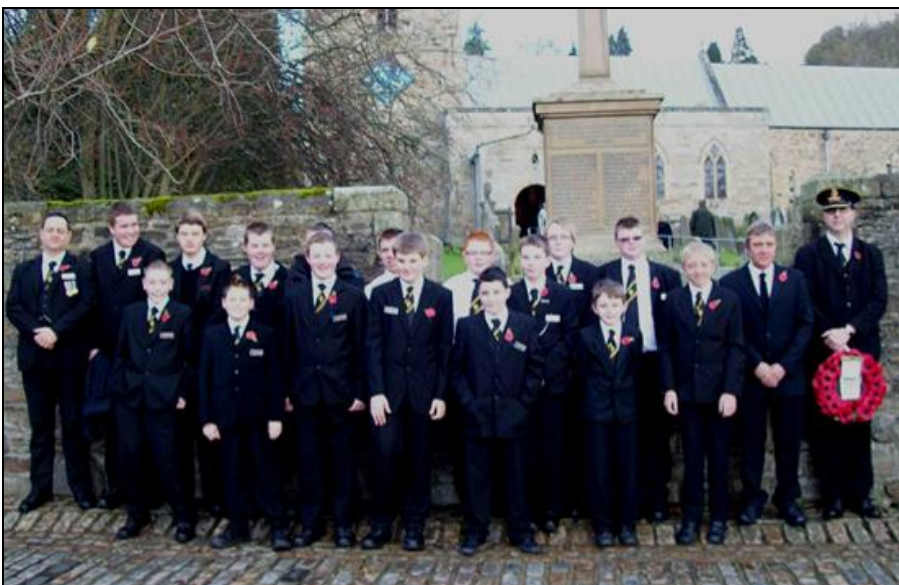
Remembrance Day in Stanhope and the largest ever attendance by the Weardale Railway Junior Club – 16 Junior and Youth team members were present – by far the largest group to attend the service.