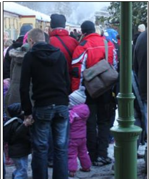
The crowded platform at Wolsingham on the day of the Butterwick Hospice special .