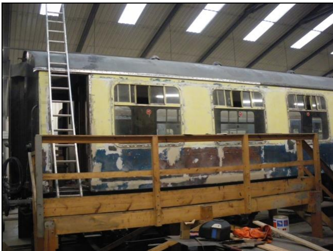
Work continues on the restoration of the Mk1 coach ‘Nina’ in the depot at Wolsingham