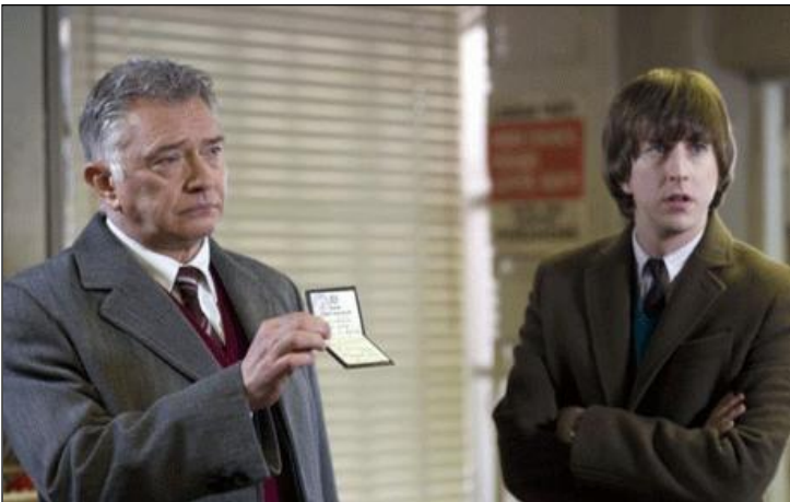
Martin Shaw plays Inspector George Gently in the TV series now filming in Weardale and other areas in the North East