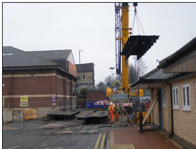
COCKTON BRIDGE at Bishop Auckland is now being replaced, necessitating both traffic diversions and train service substitution. On the left a photo from J Lewins showing the last section of the old bridge being lifted clear ( April 3 rd ) and on the right one of the deck sections being lowered in the parking area at the rear of the station – photo : K Hillary.