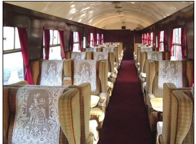
The interior of ‘Nina’ as it was in 2007 and as it will be when restoration is complete