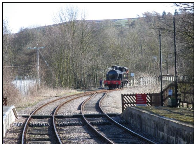
The sun catches the now well polished rails at Stanhope as No 40 runs round the loop