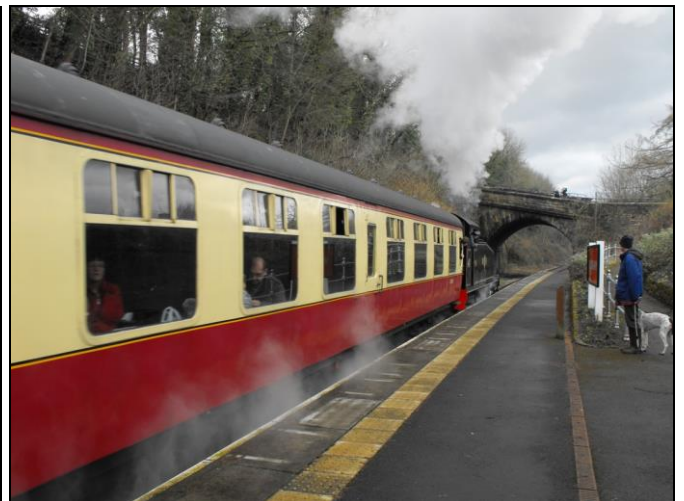
No 40 making a spirited start from Wolsingham on Easter Monday