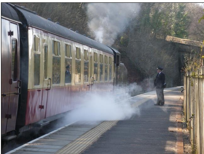
In a cold Easter, steam heating is very welcome as No 40 waits to depart from Wolsingham.