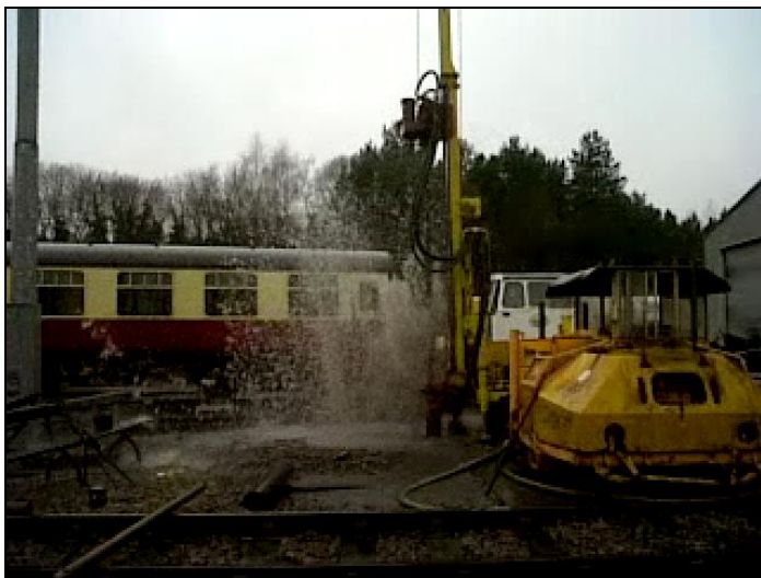
Gusher : The water well on test in the Wolsingham Depot