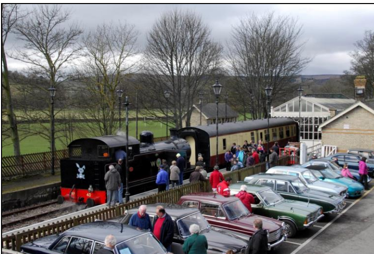
Easter Sunday at Stanhope with Classic Cars on show ( J Lewins)