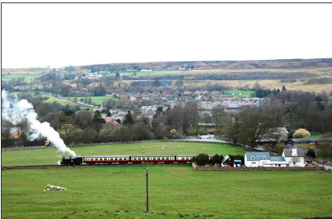
No 40 pauses with its train during the filming session adjacent to Unthank Crossing on April 19