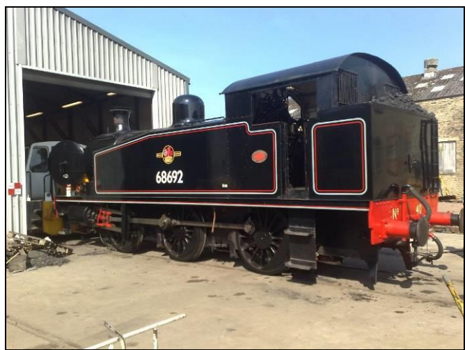
Mileposts and markers collected in the depot for repainting prior To the Official Inspection and line opening The livery it never wore, No 40 as BR 68692