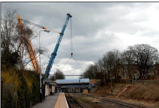
Another view of the span being lowered into position