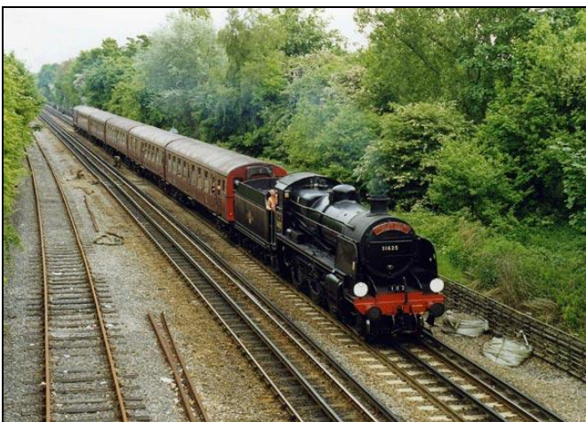
SR Class U 2-6-0 No. 31625, near Amersham on a 'Steam on the Met' train in 1999