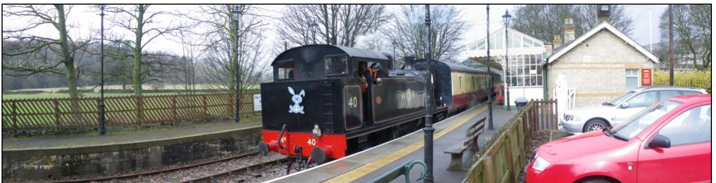
Easter Monday at Stanhope with No 40 suitably decorated