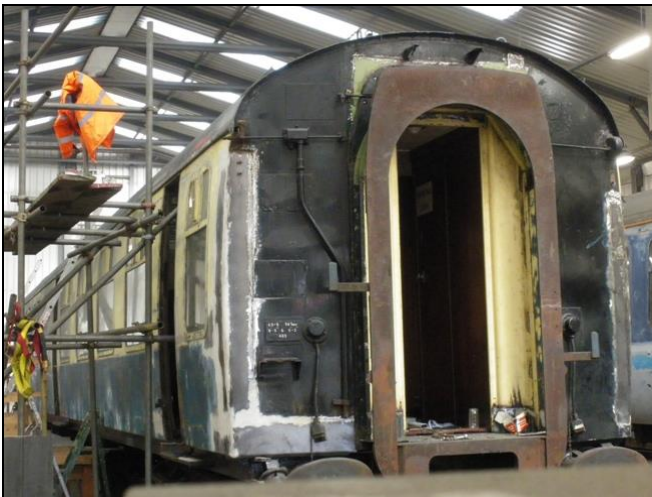
Recently completed welding on the coach ends of ‘Nina’ in the Depot at Wolsingham.