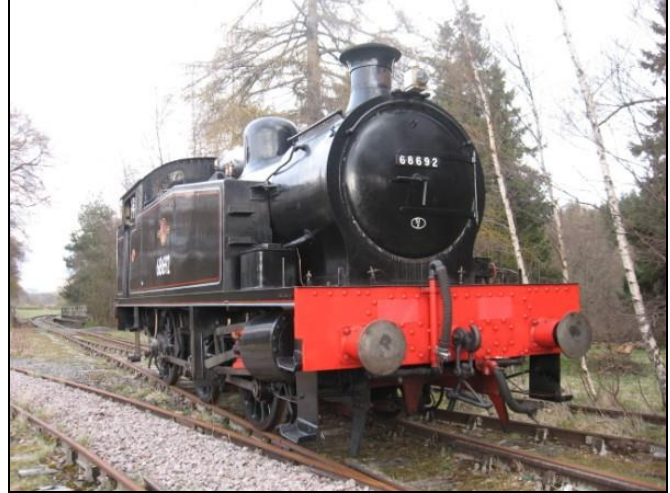
Furthest west for No 40 – standing at Eastgate after the filming