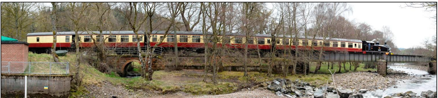
The scene of the crime : No 40 and its coaches poised above bridges 33 and 34 west of Stanhope station during the George Gently filming - The film sequences took over five hours .