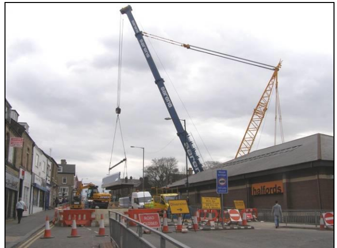
The huge crane lifting one of the bridge spans into position on the Cokton Bridge at Bishop Auckland