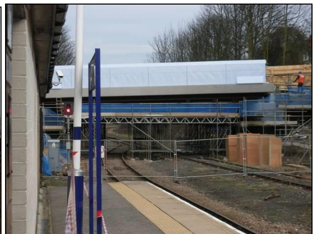
From the platform, the span in place