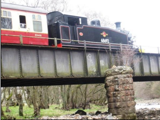
No 40 on Bridge 34 during the filming of the George Gently TV Series