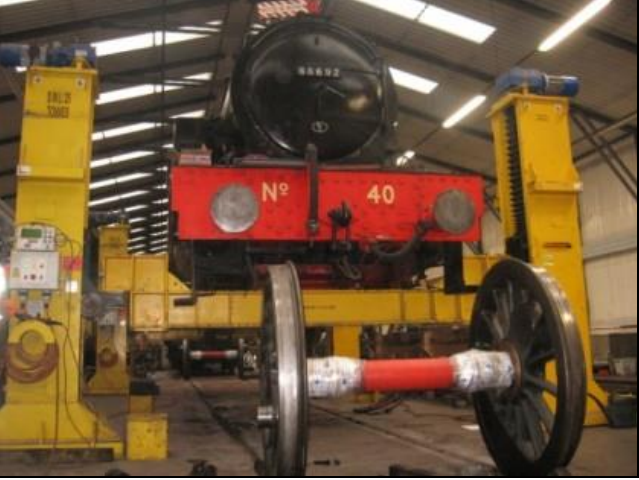
No 40 with one of the two re-machined axles

• BISHOP AUCKLAND STATION-CONNECTING THE PLATFORMS : The present temporary arrangement of a separate platform linked by a roundabout footpath may be replaced in the near future. Network Rail (NR) have agreed in principle to move to a better design. This may happen in two stages, First a direct path on railway land between the two platforms. This obviously means working on NR land and will need detailed design approval and the use of a NR approved contractor. We hope to use RMS for this work as it is already approved for Network operations. Discussions are also ongoing with Durham County Council Transport department on planned longer term improvements at Bishop Auckland – more on this later.