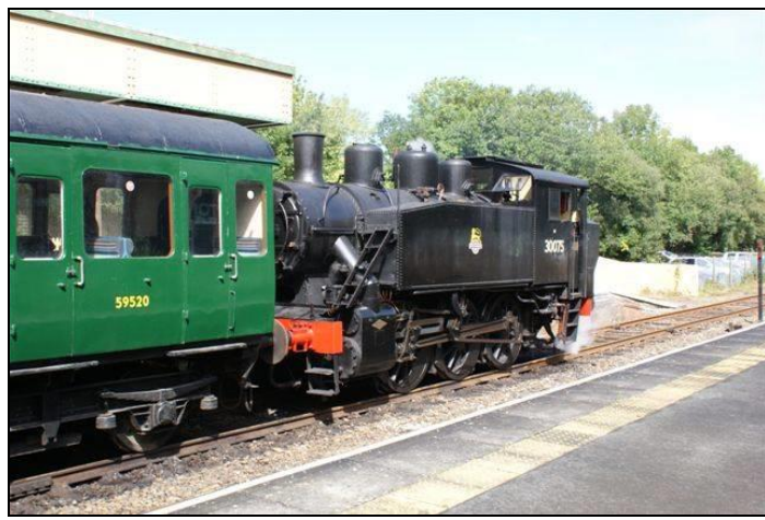
'USA' class 62 tank 300075 at Okehampton Station during Its two week stay at the Dartmoor Railway this August.

• DARTMOOR RAILWAY UTILISING FORMER YUGOSLAVIAN STEAM : Our sister company in Devon, the Dartmoor Railway, which in the summer normally operates a five days/week diesel 'thumper' service from Okehampton station has brought in a Yugoslav built 'USA' tank engine to run a steam service for two weeks from August 21<sup>st</sup>. This type of loco is no stranger to the line as they worked at Meldon Quarry until March 1967. The locomotive will return to the Mid-Hants Railway in early September. See photos below :-