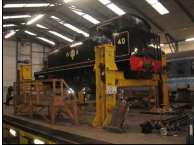
No 40 in the Wolsingham Depot raised on the jacks While undergoing work on the axles and bearings,

• No 40 : RESTORATION WORK CONTINUES : The work on two of the axle box bearings will be completed in the next three days. However on inspection of the two remaining as yet un-restored bearings our expert was of the opinion that to replace them on the newly re-machined axles would be unwise – it was felt safer to have the bearings re-machined from castings made by melting down the old bearings. This will involve further delay and although every effort will be made to have this work finished before the War on the Line event, this can no longer be guaranteed.