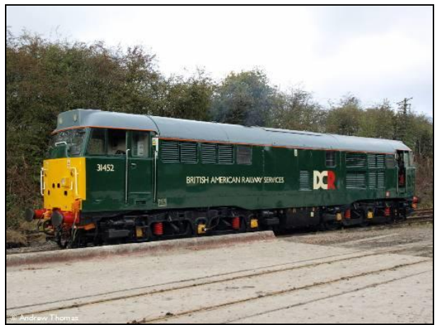
31452 at East Leake on the Great Central Railway. Thanks to Andrew Thomas for this photo. See this and his other photos at : <u>http://andrewthomas.fotopic.net/</u>

WOLSINGHAM SHOW : SPECIAL EXTRA SERVICES TO SHOWGROUND : September 4<sup>th</sup> and 5<sup>th</sup> will see a greatly augmented service on the Weardale Railway to serve a special temporary platform at the Wolsingham showground. This has involved some intricate timetable planning as it is intended to use both 141 diesel multiple units operating independently with the additional complication of fitting in a Charter from Dundee and Edinburgh on the Saturday. On Saturday (4<sup>th</sup>) there will be eight services to and from Bishop Auckland during the day, four terminating at the Wolsingham Showground while four will continue on to and from Stanhope. On the Sunday there will be seven services to and from Bishop Auckland with three running on to and from Stanhope. Our normal community rail fares will apply (£5.30 return from Bishop Auckland) For these purposes the showground will be treated as though it were Wolsingham. Anyone travelling to or from the showground to Wolsingham itself will be charged 50p. Please be ready to point out to intending passengers that the temporary platform has only a step access and is unsuitable for disabled passengers. For more information on the show, see : http://www.wolsinghamshow.com/index.htm