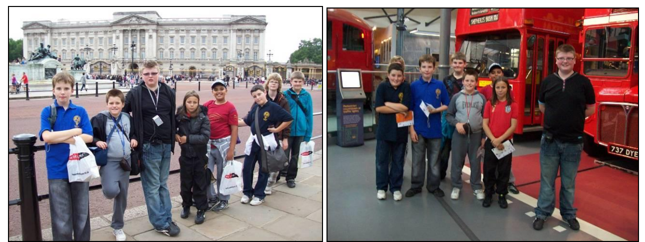
New recruits : the members of the Bishop Auckland Branch of the WRJc on their trip to London beside a well known landmark and in the London Transport museum.