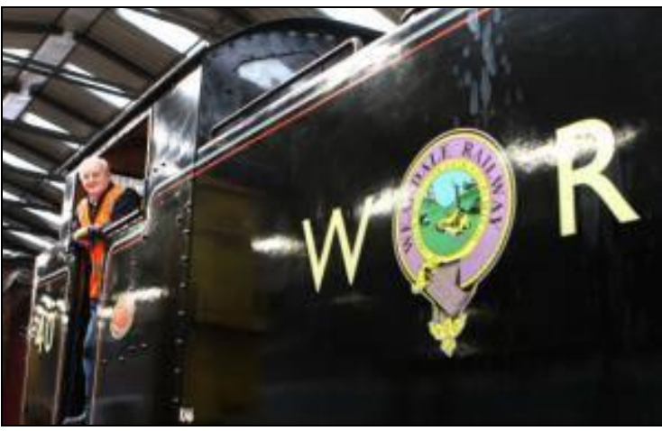
Trevor Hewitt at the footplate of No 40 – see above (Both Photos : Northern Echo )

Courtesy : Northern Echo : 12<sup>th</sup> August