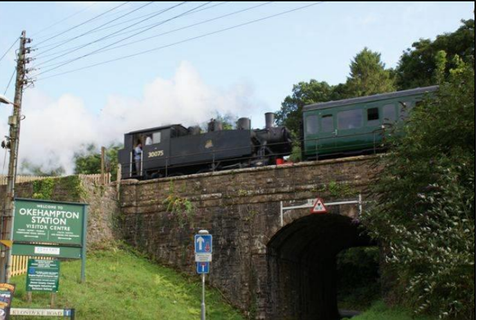
30075 stating the climb from Okehampton towards Meldon Quarry.