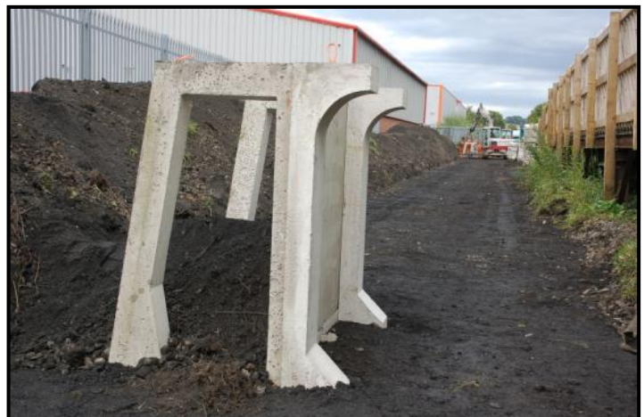
Photo Miscellany 2 : Left : On 20 th July Stanhope station was invaded by a group of artists. A general invitation was taken up to paint and draw the railway and everyone loved it! David Scott the Controller for the day was amazed at the good standard of pictures produced, but even more amazed at the enthusiasm the group showed for the railway and the variety of subjects and scenes available to draw. Many of the artists promised to return to do additional work. ( D Scott) Right : Two of the new concrete platform support members in place at Bishop Auckland. The platform will extend past the first (red edged) building on the left. Beyond is the B & Q (orange) building and the Network Rail platform. (Photo : T Horner)