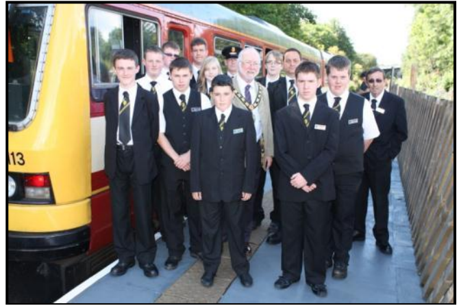
The Junior Club and Youth Team members with the Mayor of Bishop Auckland to receive his donation to the Club.