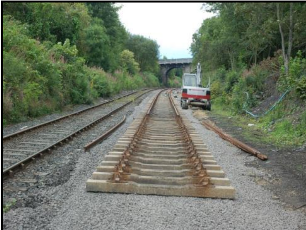
August 18 th : a view looking west towards Latherbrush Bridge, mainline on left, work on new siding underway