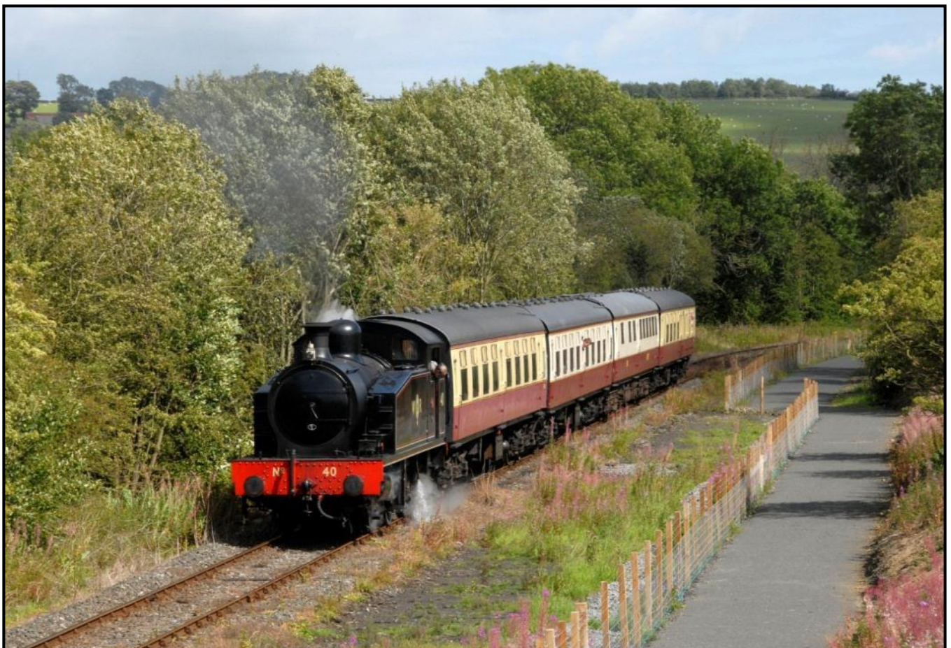
Finally a fine location shot from John Lewins, No 40 heading back to Stanhope, just past the Engineman's Terrace Crossing. Taken on the 21 st August. On the right is the completed but not yet officially opened extension of the Durham County Council footpath alongside the line on land leased from the Railway.