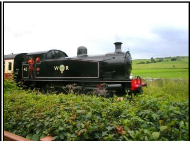
No 40 again on a test run on August 28 th passes the editor's lineside caravan at the Kingfisher Park near Frosterley