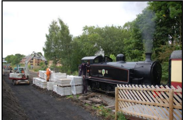
August 20 th : No 40 has arrived at Bishop Auckland West while work commences on the new platform which will be made from pre formed concrete sections.