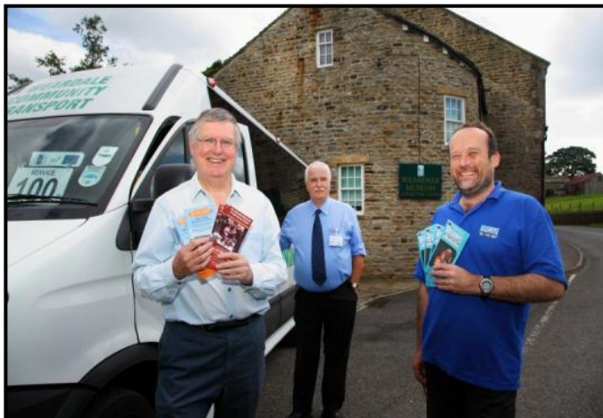
Service 100 : Stanhope Station to Alston Station – the launch of the new Community Minibus by the partners in this Tourism Transport Project