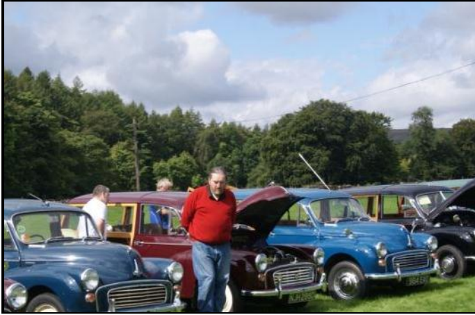
Some of the vehicles lined up for display at the Morris Minor Club Rally at Stanhope Station on August 21 st