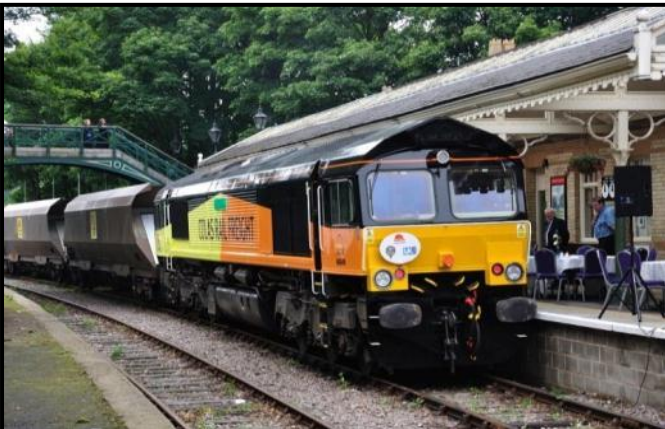
Colas Class 66, No 66849, with two coal hoppers standing in the platform at Stanhope prior to the naming ceremony on 2 nd August