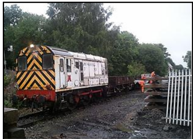
First of a number of photos in this edition to illustrate progress on the new layout at Bishop Auckland shows a works train on August 12 th delivering materials.