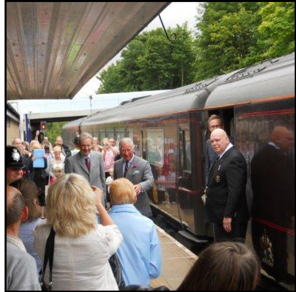
Crowds greeted the arrival of the Royal Train at Bishop Auckland on July 23 rd . Tornado headed the train and was topped and tailed with 67026.