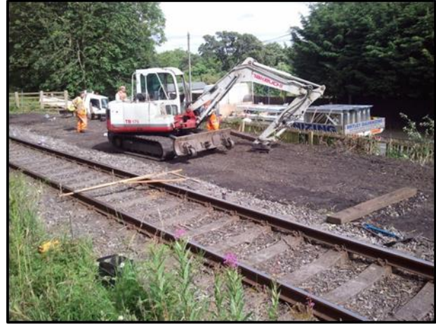
Two views of the preparatory work underway to build a permanent platform at Witton le Wear. The work is being undertaken by RMS and could be ready for use in August.