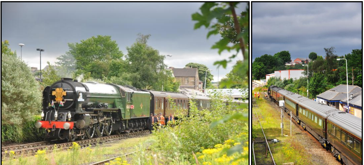
Tornado arrives at Bishop Auckland with the Royal Train on the 23 rd July. On the right looking towards the Weardale Railway platform, the loco is being watered and prepared for the return to Darlington and the journey north.