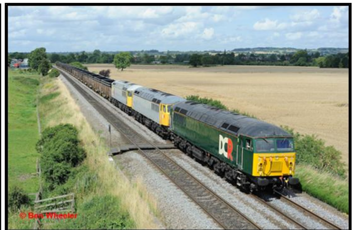
3 DCR Class 56's. Hauled by 56303 are classmates 56312 and 56311 and 20 refurbished JRA wagons at Sawley, near Long Eaton, 4 th August. (see news item)