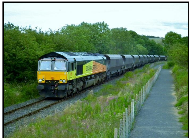
66487 passes Wear Valley Junction with the morning coal empties returning to Wolsingham, 21 July.