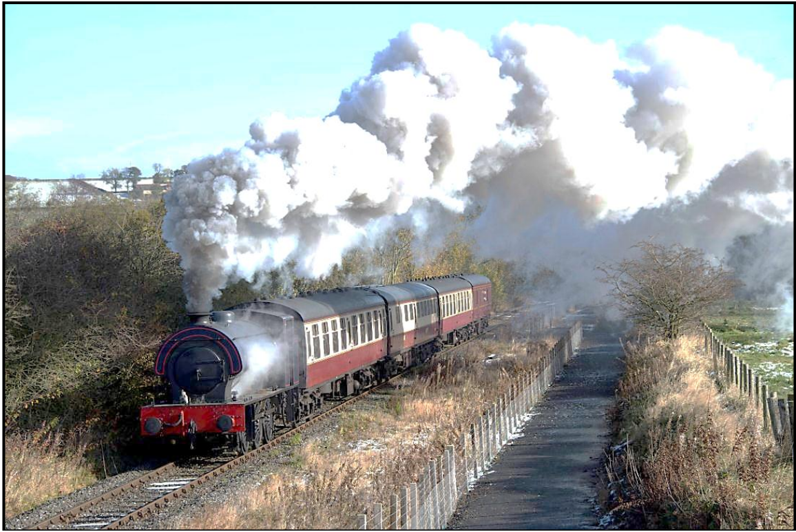
Farewell 'Wilbert'. The summer visitor from the Forest of Dean Railway is seen on its final weekend of operation before its return at the end of the Weardale Railways 2012 operating season. Seen here approaching Enginemans Terrace on October 27 th.