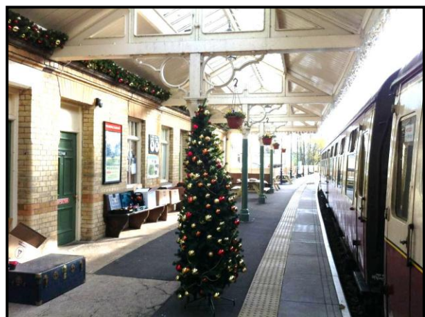
Preparations for Polar Express underway at Stanhope : on the left a view from the station footbridge of the matting being laid in the field next to the down platform and on the right work is underway on decorating the up platform – both photos taken on the 11 th November