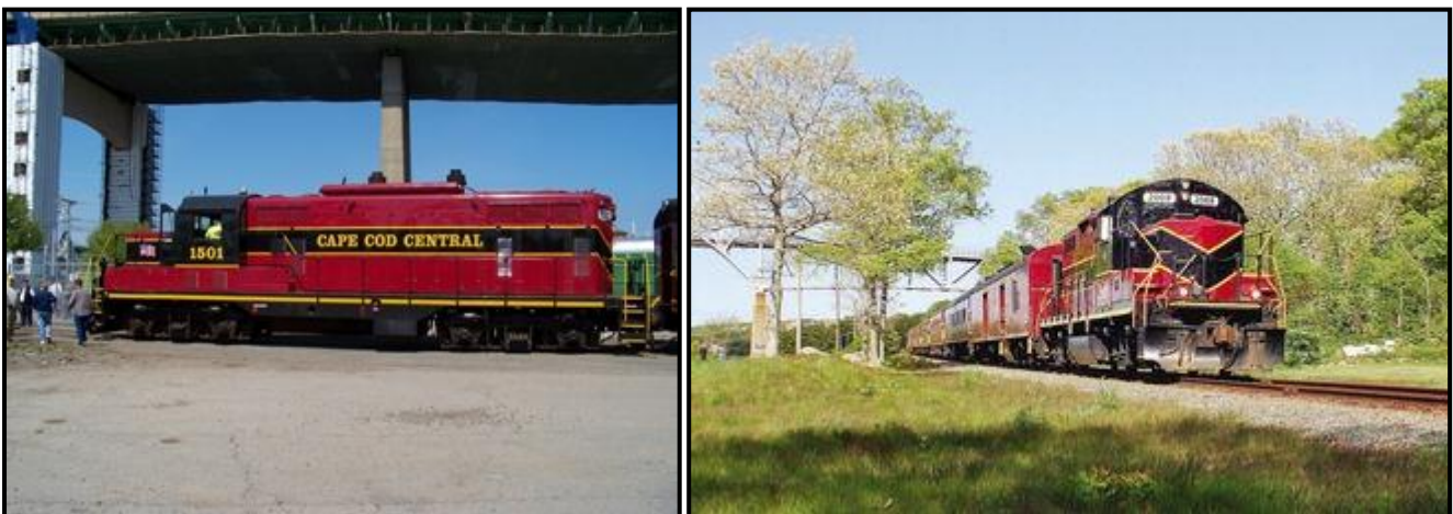
Cape Cod Central is the passenger operating arm of Cape Rail, a recent Iowa Pacific acquisition (see article). It operates tourist trains, dinner trains and also the Polar Express and has aims to build up the freight service and connect with the Boston commuter rail network.