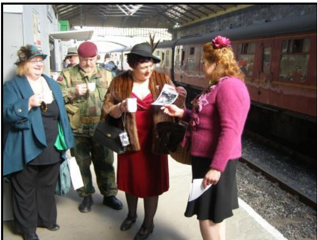
The extended Hillary Family spent their time at the NYMR wartime weekend promoting Weardale Railway’s War on the line event to be held on the 13/14 th July 2013