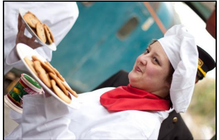
Two photos from the Press Day as the staff prepare to receive over 25,000 visitors. Santa and his elves will proceed through the train where children who really believe will get a silver bell plus hot chocolate and cookies as the Polar story is retold with a cast of actors and a full sound system.