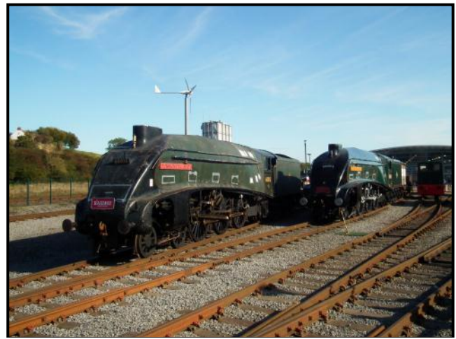
Shildon in October. here are 60008 'Dwight D Eisenhower' and on the left 60010 'Dominion of Canada' ( Chris Simpson)