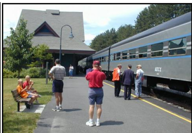
Two views of the Adirondack Scenic Railroad where Iowa Pacific aims to develop a through overnight Pullman sleeping car service between the Lake Placid area and New York. (See article). Photo on the left a train en route to Saranac Lake Union station, which is shown on the right.